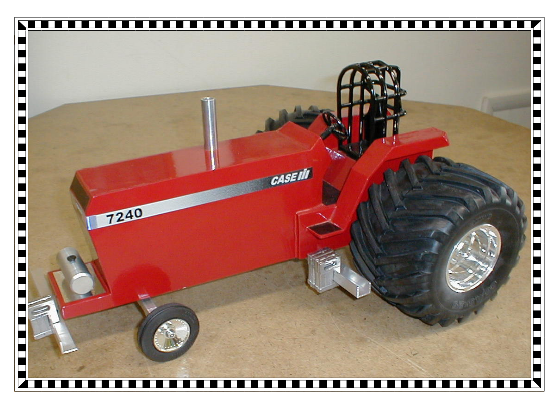
This tractor is being raffled to raise funds for the NR/CTPA. All proceeds go directly to help with equipment purchases.

The winning ticket will be pulled at our Spring National Fundraiser in the Spring of 2007