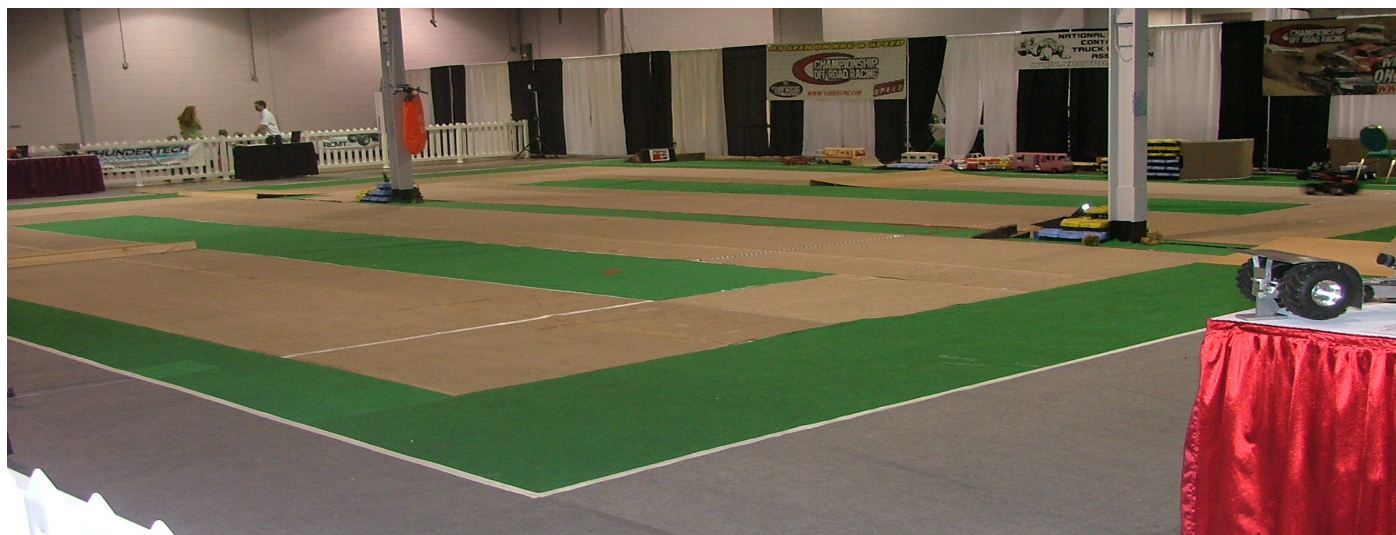
This is the layout from the 2007 iHobby Expo. Most of the time trucks were running around the course and people were lined up to watch. The association plans to do this show again next year. So after you attend the World Championships plan on coming to the iHobby show in the greater Chicago land area.