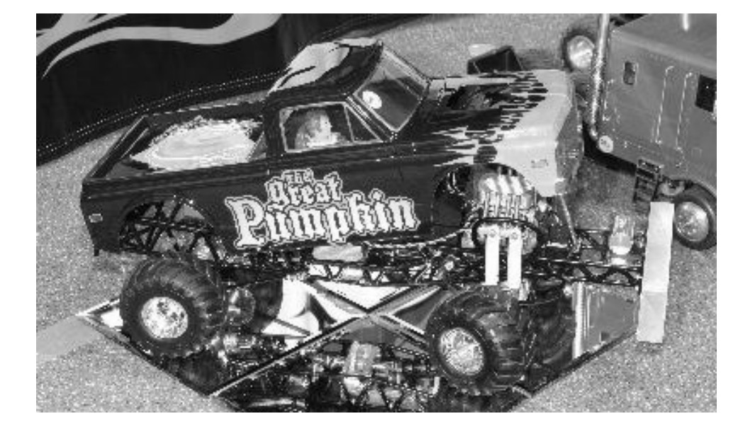
Above; Pulling Concourse, Presidents Award, and Best Engineered Puller award winner